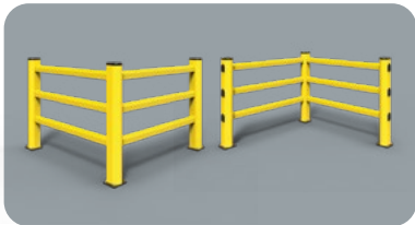
PED 150 2000x1150 CORNER