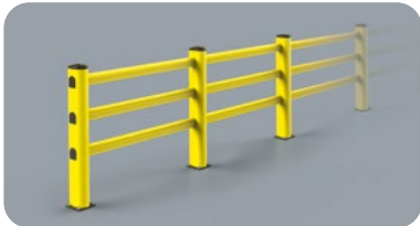
PED 150 2000x1150 MODULAR